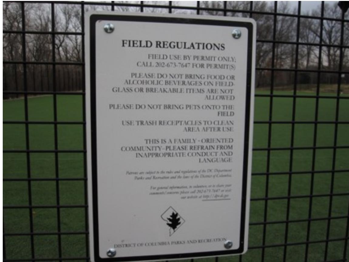
Controlled Access to Artificial Turf Field